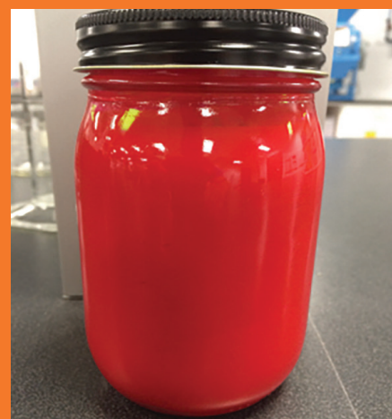
CruiserMaxx Vibrance Beans